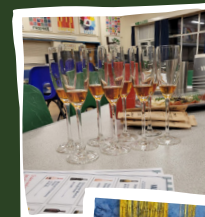
WINE TASTING NIGHT