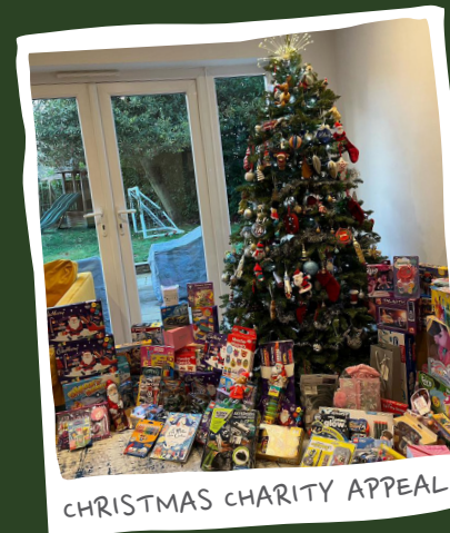
CHRISTMAS CHARITY APPEAL