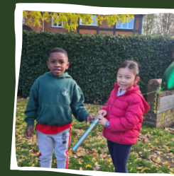
SPONSORED RELAY RACE